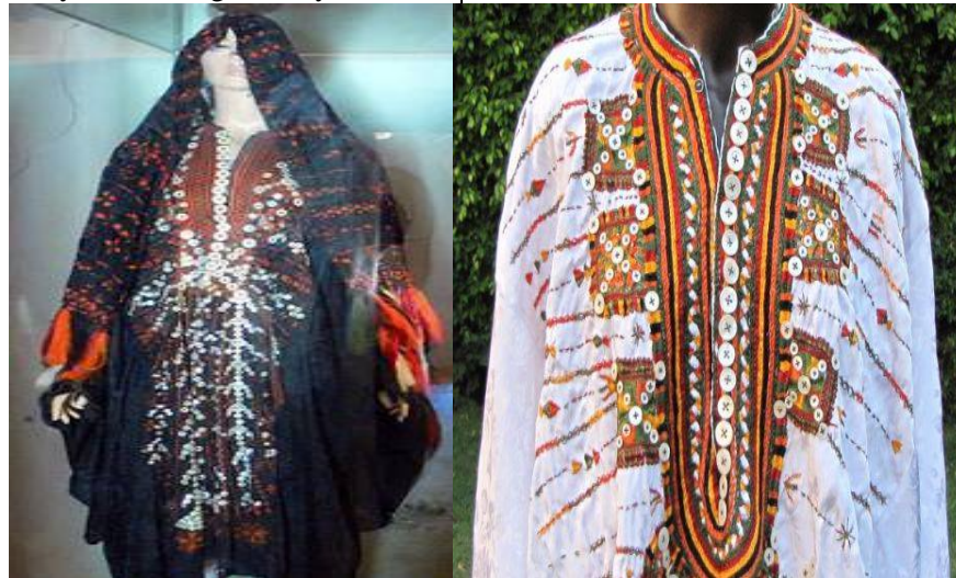
Fig (2) Black and white wedding robe in Siwa

are similarly associated with the sun. There is another style of shawl which is worn by women of the Oasis when outside their family home. It is a large rectangular piece . Girls from Siwa were expected to prepare up to seven pairs of trousers prior to their wedding .(3,8,9)