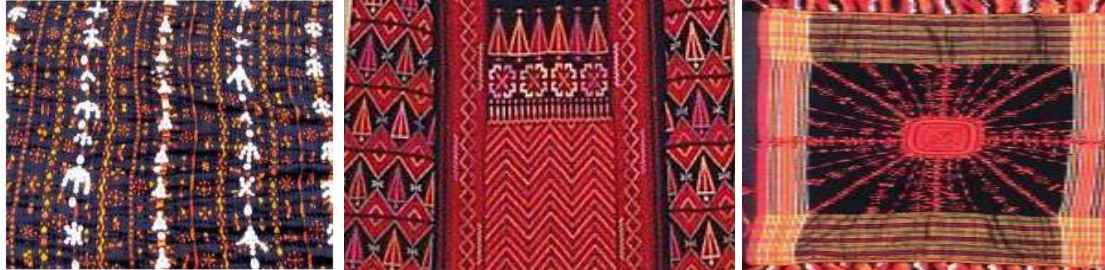
Fig.(1) samples of Siwa cloth

link with the ancient Egyptian sun god Amun-Ra may be the origin of this radiating "sunburst" design always found embroidered in multi colored silks on Siwan wedding dresses. The T-shaped black wedding dress was worn on the seventh day of the wedding. The mother of pearl buttons that cover the front panel of the dress may have a talismanic function, repelling bad luck.